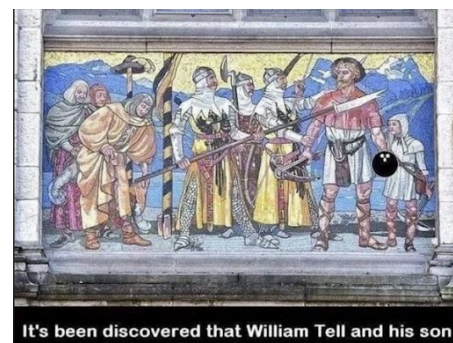
belonged to a bowling league. But Swiss historians have not been able to determine the name of the league's sponsors. So we'll never get to know for whom the Tells bowled.